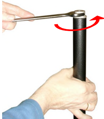
2. Unscrew handle connector