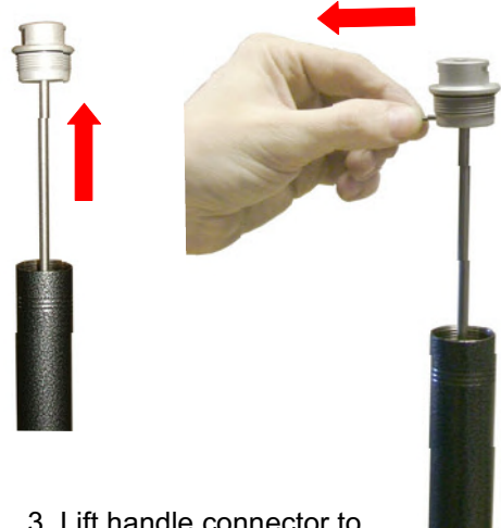
3. Lift handle connector to expose pin. Use suitable tool to push pin from one side and then pull out.