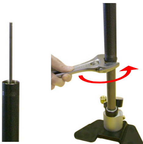
4. Unscrew outer body tube end cap and remove body tube