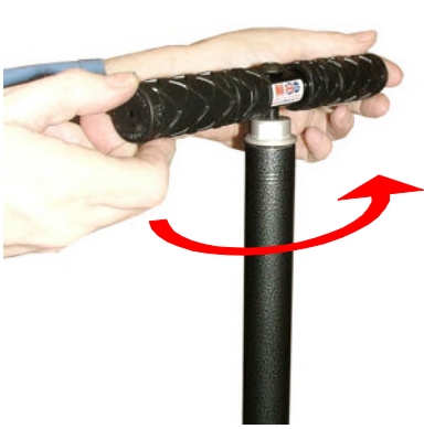
1. Unscrew and remove handle

Kit comprises of 1 small green seal, 1 small black seal and 1 large black seal