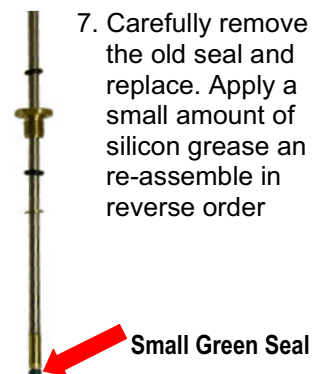
7. Carefully remove the old seal and replace. Apply a small amount of silicon grease an re-assemble in reverse order